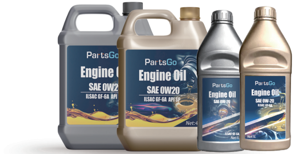
PRODUCT INTRODUCTION Two Styles

The unique formula ensures good engine lubrication while effectively reducing the coefficient of friction, Which significantly improves fuel efficiency and saves you money on fuel. The semi-synthetic nature gives it a good price/performance ratio, Which can meet your requirements for oil quality without putting too much pressure on your wallet.